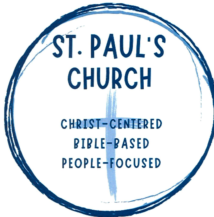
Back Side of Shirt