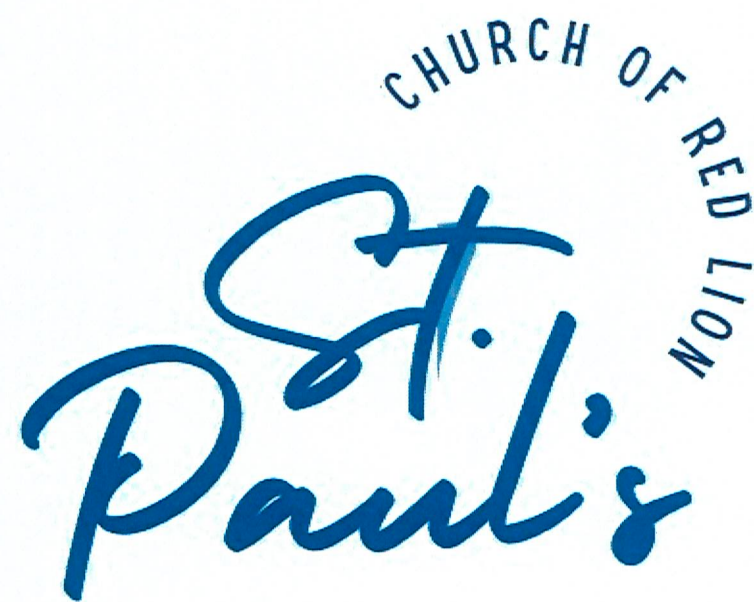
Front Side of Shirt